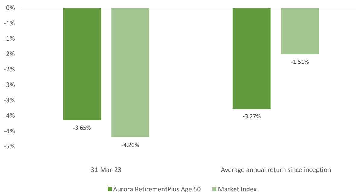
Annual Return Graph ii

This shows the return after fund charges and tax for each year ending 31 March since the fund started. The last bar shows the average annual return since the fund started, up to 30 June 2023